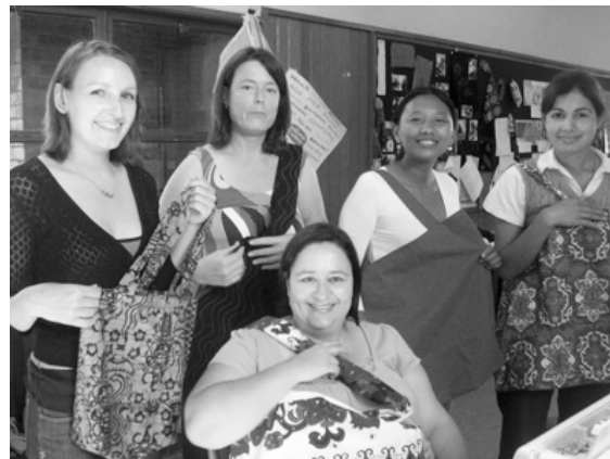
MWSG leaflet v.5 May2010 Download current leaflet from http://mc2.vicnet.net.au/home/sewgroup /shared_files/Leaflet.pdf

(We love donations of preloved crafty materials, patterns, equipment, books, and of course money. Give us a call)